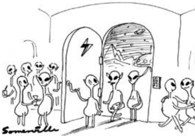
"Sorry we're late. We went to the wrong house in a parallel universe."

"In this age, people are indulging in the